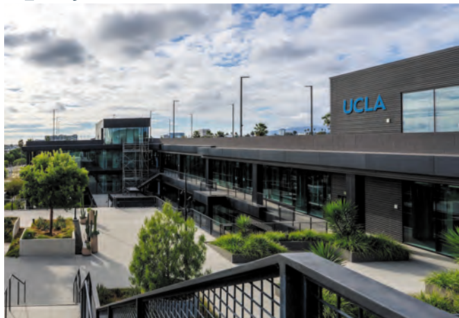
Artists rendering of research park